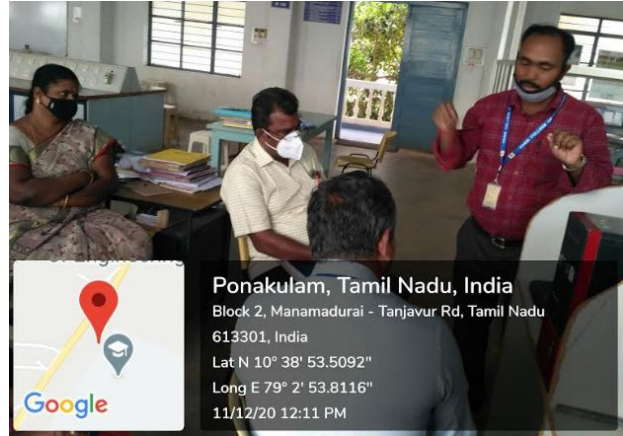
Snapshots from the Seminar session