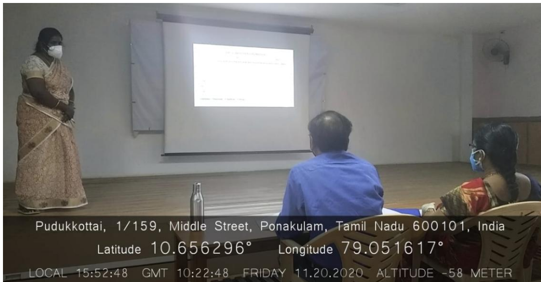
Snapshots of the meeting held